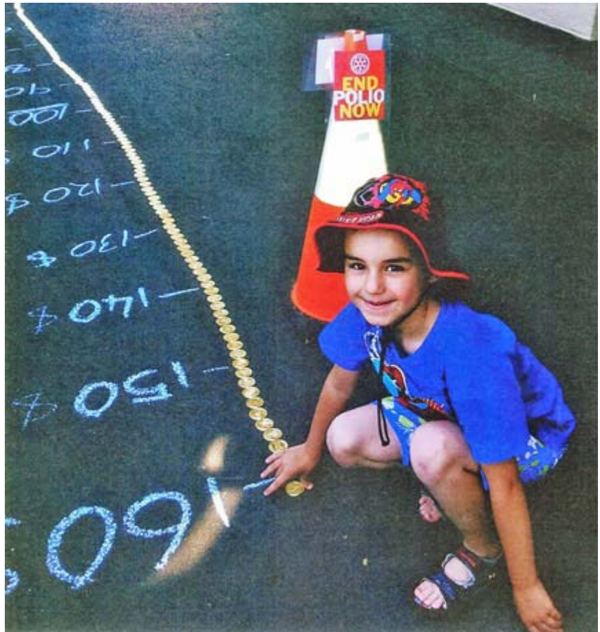
Recent Young Rotary coin trail raised $900 to help END Polio