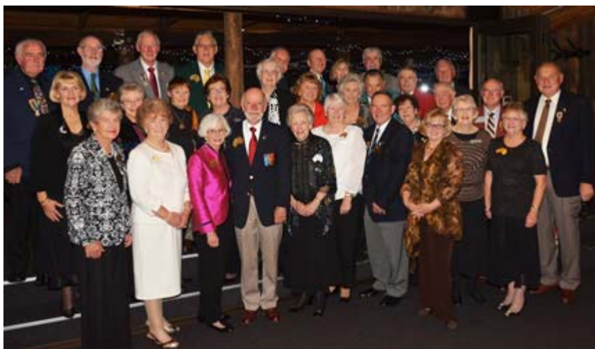
Orange District Changeover photo of 14 Past District Governors and 3 widows of PDGs